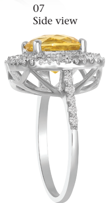
07 Side view