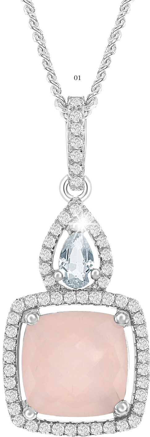
01 BLK-7550 Sterling Silver Rose Quartz & White Topaz 3.86 cttw 17+3" Necklace